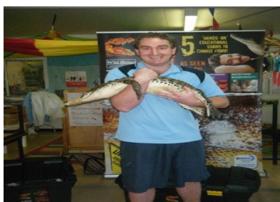
The crocodile Hunter

On the 20 th we had a visit from Wildaction who promote environmental awareness and enabled the children to experience Australian wildlife. Every child had the opportunity to touch the animals.